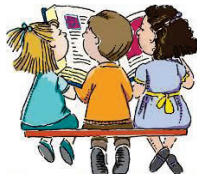
Share God's Word

All Sunday children's Programs will resume on September 13 th during the 9:30am Mass.